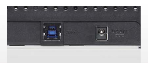
High speed performance through USB 3.0 interface