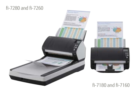
fi-7160/fi-7260 – A4 Portrait at 300dpi 60ppm/120ipm fi-7180/fi-7280 – A4 Portrait at 300dpi 80ppm/160ipm Scan mixed batches up to 80 sheets